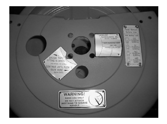
14" Sheave Part Number RS-14-1380 Figure 1

Safe working load tags are to be added to all sheaves, except those sold directly to Baker Atlas. The position of these tags is shown in the figures below. Install the tags with 1/8" aluminum rivets.