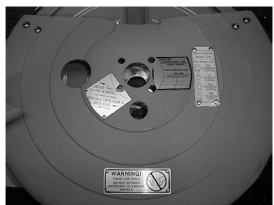
17" Sheave Part Number RS-17-1380 Figure 2